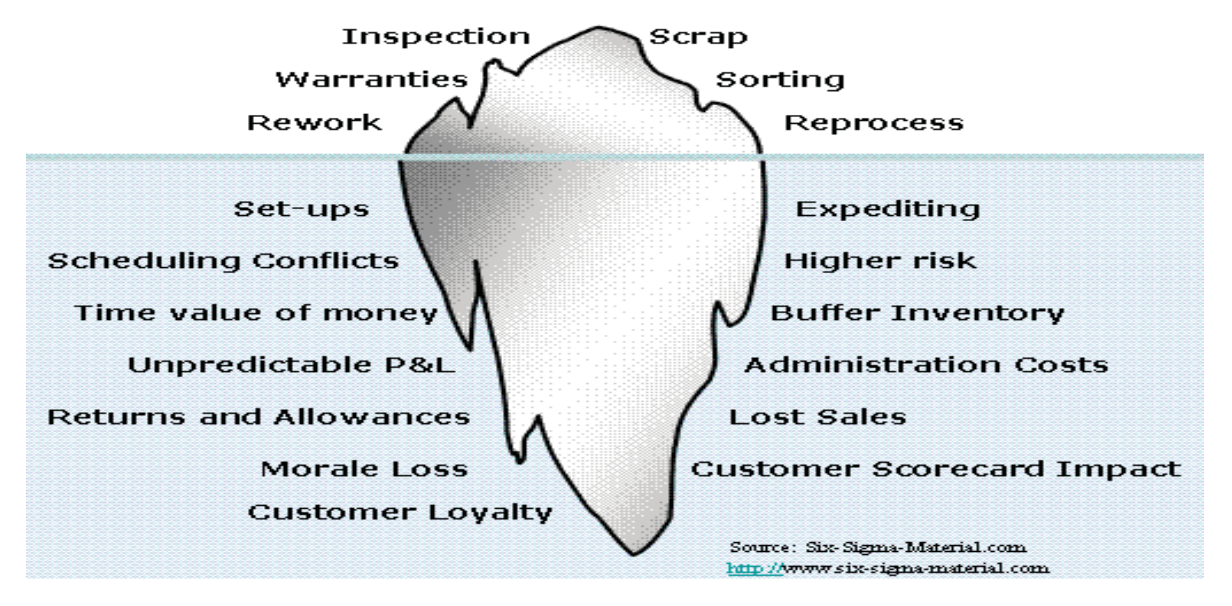
Figure 3.1 – Hidden and visible COPQ 10

The obvious and "visible" costs are a small portion of the overall COPQ. The bottom of the iceberg represents the majority of the COPQ and are not as easily identified and quantified.