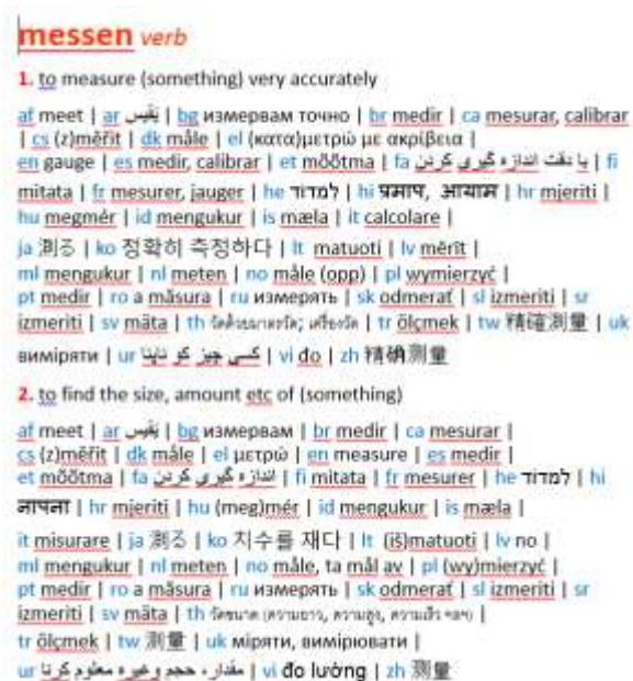
Figure 4. The first two senses of messen in the automatically generated German multilingual glossary.

Unfortunately, the indirect juxtaposition of different languages through the English pivot is bound to include inaccuracies. Nevertheless, the