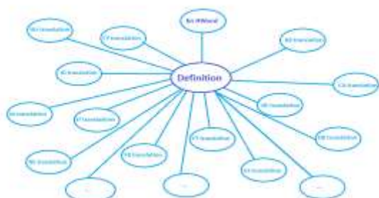
Figure 1. Parsing the XML data and preparing translations in different languages.

The outcome of this parsing is illustrated in Figure 1.